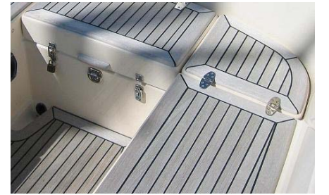
The teak surfaces on this 8 year old HR34 were treated every autumn with Boracol 10Rh. Halberg Rassy recommend Boracol 10Rh for teak surfaces on their boats.